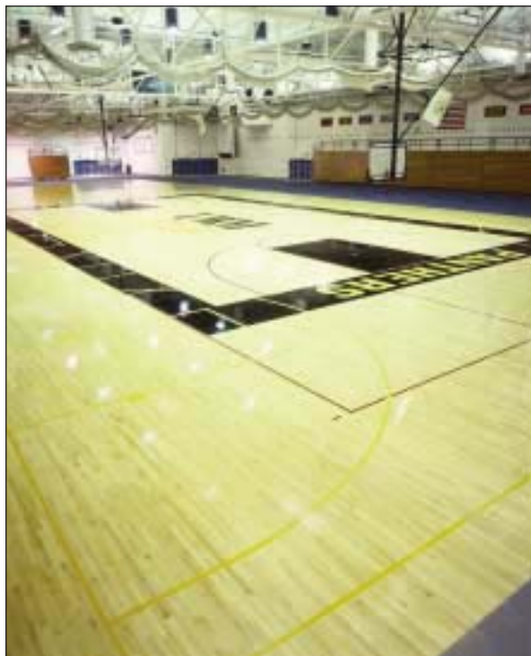
Sports floors are the main focus of the MFMA.