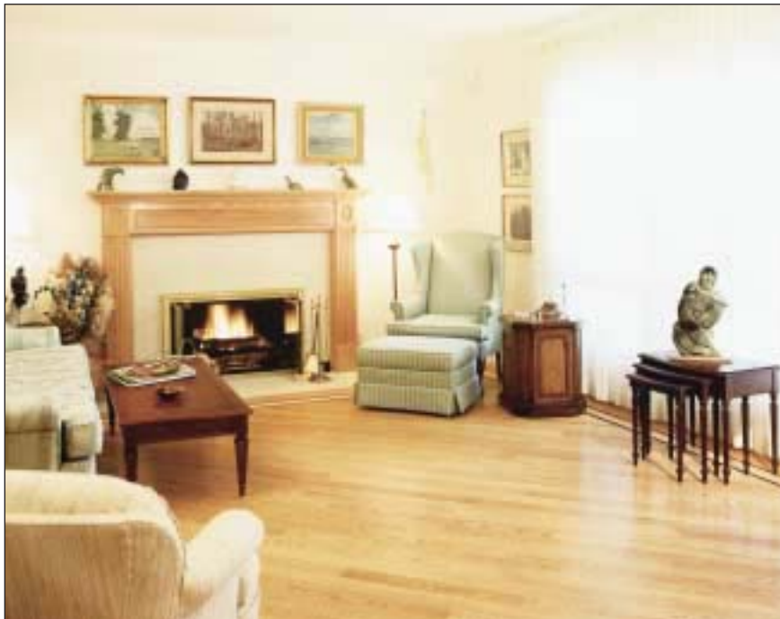
Maple floors are the majority of those manufactured by CLA-member mills.