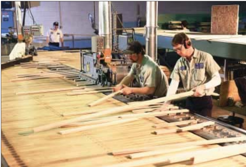
Grades were developed to bring a degree of consistency to wood floors.

Manufacturers must be members of such associations to qualify for their grading dispute service. In other cases, hardwood flooring manufacturers determine their own classifications and create their own grades, or "proprietary grades," by which they sell their flooring.