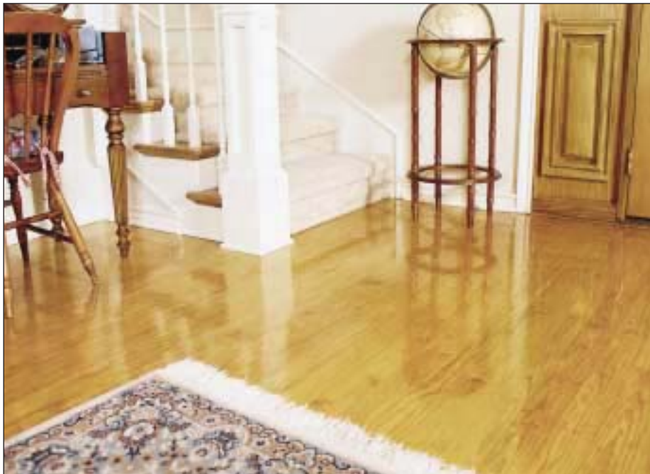
Southern pine floors such as this one are graded according to standards established by the Southern Pine Inspection Bureau.

C&BTR, D and E. There are also several agencies in the western states that can be hired to grade according to the WWPA or WCLIB grades.